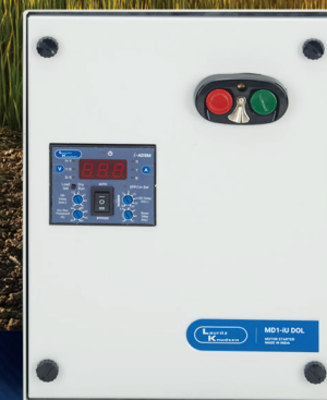
MD Starter+ DOL